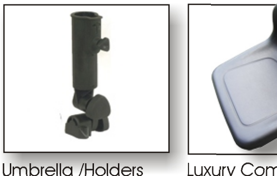
Luxury Comfort Seat