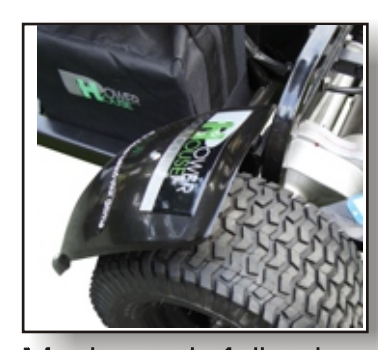
Mudauards full set