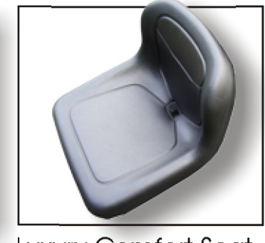
Luxury Comfort Seat