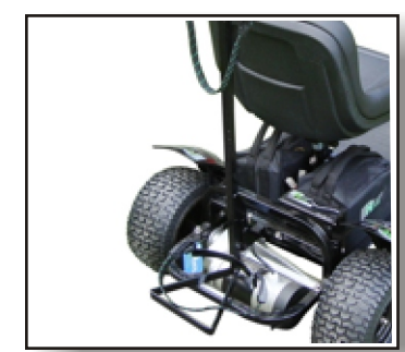
32" Bag Stand